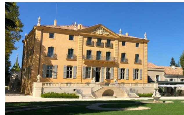
Member Relais & Châteaux since 2018 Route de Saint Canadet 13610, Le Puy-Sainte-Réparade (Bouches-du-Rhône)

Hotel and restaurant in a park. Once home to a large family of Provençal humanists, Château de Fonscolombe has preserved its soul. Its salons of Genoa leather and Chinese wallpaper still resonate with their lively character. The park, with paths lined by majestic trees, is the fantastic oeuvre of a lineage of botanists. As for the restaurant La Table de l'Orangerie, it too has embraced the chic, rustic and Provençal charm of the estate. Soft and subdued in winter, it takes its summer quarters in the shade of a large bald cypress. Chef Marc Fontanne breathes his creativity into a modern cuisine with original Provençal flavors in harmony with the richness of the terroir.