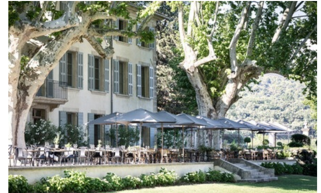
Member Relais & Châteaux since 2019 Route de Roquefraiche 84360, Lauris

Hotel and restaurant in the country. In the heart of the Luberon Regional Nature Park, stop and enjoy a break at Domaine de Fontenille. Worthy of a novel by Giono or Pagnol, this mansion wrapped in cedars and century-old olive trees is a celebration of the charm and magnetism of the Provençal countryside, the perfect setting to experience French art de vivre. Elegantly combining period details and craftsmanship, the property's decor draws inspiration as much from family homes full of keepsakes as from the contemporary art centre in its former cellar — original works adorn the nineteen rooms and suites overlooking the park, which include an old wash house converted into a romantic little den. Le Champ des Lunes, the Michelin-starred restaurant of chef Michel Marini, adds to the magic of this place, as do the spa and the centuries-old vineyard and kitchen garden that are open to the public.