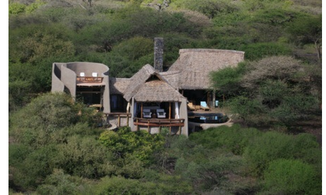
Member Relais & Châteaux since 2013 Mbirikani Group Ranch Chyulu Hills - Amboseli

Lodge and restaurant in a private game reserve. Wake up to snow-capped Mount Kilimanjaro and the distant roars of lions. ol Donyo Lodge is a pioneer amongst safari lodges, and a forerunner of sustainable tourism: by working with the local Maasai people, it has been able to blend conservation and livelihood benefits. On the slopes of the Chyulu Hills, this lodge blends contemporary and traditional design. To stay here is a chance to explore Africa in an uncommon way - by horseback or four-wheel drive, on foot or in a hide twenty paces from some of the largest elephants in the world. ol Donyo Lodge enjoys a stunning location, with the savannah at its feet stretching as far as the eye can see. This is the Africa of the mind's eye.