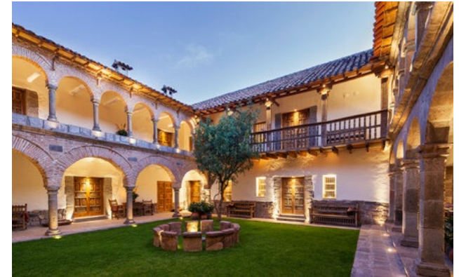
Member Relais & Châteaux since 2010 Plaza Las Nazarenas 113 Cusco

Hotel and restaurant in town. This exquisite 16th-century colonial manor was one of the first Spanish buildings in Cusco, located just steps away from the picturesque main square. Once occupied by the conquistadors of Peru, it is now an exclusive boutique hotel that has been carefully restored to retain its historical heritage and décor. With its suites set around a Spanish courtyard, replete with antiques and original architectural details, Inkaterra La Casona offers sober elegance without sacrificing authenticity. This is the perfect base from which to explore the vibrant capital of the Incan Empire and absorb the mysticism of the surrounding Andean valleys and villages.