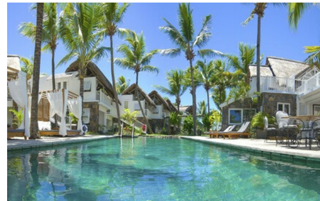
Member Relais & Châteaux since 2013 Coastal Road, Pointe Malartic Grand-Baie Pointe aux Canonnières

Hotel and restaurant on the seafont. A delightful colonial mansion, nestling in a coconut grove right at the water's edge, is home to a tastefully appointed, charmingly refined little hotel. The soft, neutral shades of Flamant Home Interiors furniture in its individually designed guest rooms stand in brilliant contrast to the blue of the sea and green of the coconut palms, instilling deep feelings of peace and seclusion. The restaurant, also at the water's edge, serves delicious creole and international dishes. However 20° Sud has two more treasures in store: the M/S Lady Lisbeth, the oldest motorboat on the island which, when evening falls, takes a party of guests to dine under the stars on the calm waters of the bay.