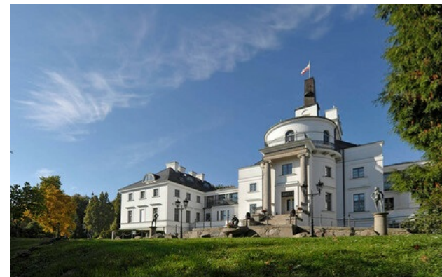
Member Relais & Châteaux since 2002 Burg Schlitz 2 D-17166, Hohen Demzin (Mecklenburg-Vorpommern)

Main Restaurant: lunch, Monday evening, Sunday evening (from January 1st to December 31st). "Café-Brasserie Louise": dinner from Tuesday to Saturday.