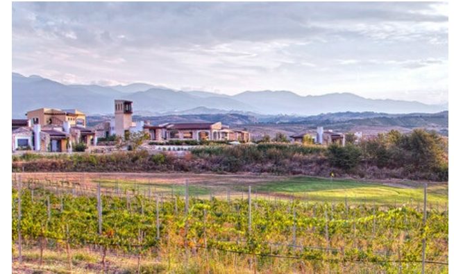
Member Relais & Châteaux since 2017 2821, Zornitza Village (Sandanski)

Hotel and restaurant in the country. Built from the heavy stones and the dreams of a family of aesthetes enamoured with their home country, Zornitza Family Estate produces wine, honey and truffles; cultivates organic fruits and vegetables; and raises its own livestock. The main house boasts a contemporary design, yet traditional materials. The cuisine is amazing; the service delectable. Staying at this property is a unique opportunity to discover southern Bulgaria in all of its luxury and authenticity — from local traditions to the historical richness of its sites dating to the Northern Thrace and ancient Greece, but also to the tastings of stunning wines in the estate’s marvellous cellar and the thirteen wineries in close proximity.