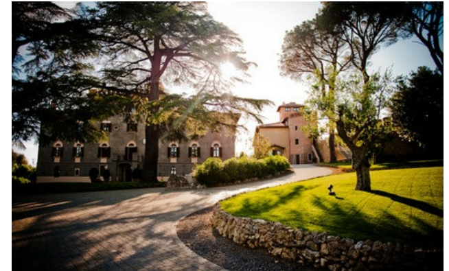
Member Relais & Châteaux since 2013 Strada Montepetriolo, 26 06132, Perugia

Hotel and restaurant in the country. The luxuriant green countryside of Umbria, the “Garden of Italy”, is the perfect setting for this ancient mediaeval fortress. It is an impressive collection of neo-Gothic buildings, a Baroque chapel, surrounded by parkland planted with trees over one hundred years old and an olive grove, which offers outstanding hospitality. Outside, the infinity pool, the flower-bedecked courtyards and the shaded paths offer a cool haven of peace. Inside, the contemporary décor of the rooms and the elegance of the lounges also combine to create a wonderfully relaxing atmosphere. The restaurant serves traditional dishes in a vaulted dining room or on a terrace overlooking the hills.