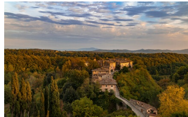
Member Relais & Châteaux since 2013 Località Borro 1 52024, San Giustino Valdarno (Toscana)

Hotel: lunch from Monday to Friday and dinner from Sunday to Thursday (from January 1st to March 14th) (low season). Main Restaurant: lunch and dinner from Sunday to Thursday (from January 1st to March 1st) (low season), lunch (from March 15th to November 11th) (high season). "Il Borro Tuscan Bistro": diners and lunch from Monday to Thursday (from January 1st to March 1st) (low season).