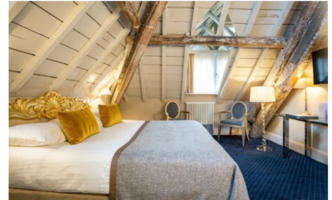
Member Relais & Châteaux since 2012 18, Place d'Armes L-1136, Luxembourg

Hotel and restaurant in town. Le Place d'Armes is a charming hotel on the place d'Armes, the historic heart of Luxembourg, a meeting place in summer and winter, close to the "Cercle Cité", the business and pedestrian shopping district. Past and present are perfectly balanced in the 18th century building, which skillfully blends Art nouveau, a revisited Baroque and contemporary styles. Each of the guest rooms and suites is decorated in a delicate colour palette and has its own style and charm. The gourmet restaurant La Cristallerie focuses on exceptional products and the Plëss has the charming atmosphere of a chic brasserie, whilst the renowned Café de Paris is marked by a bistro atmosphere.