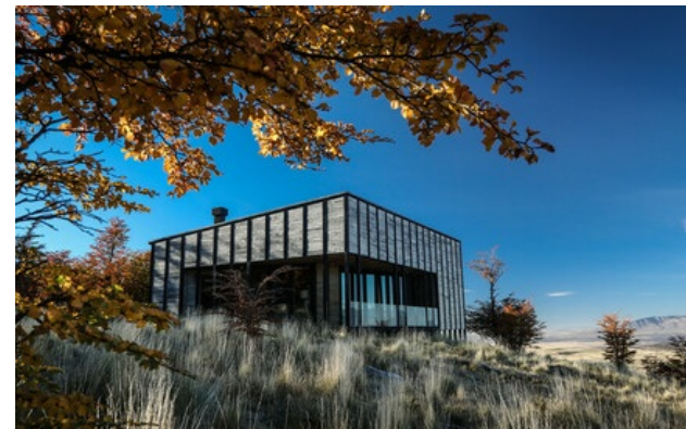
Member Relais & Châteaux since 2014 Estancia Tercerra Barranca s/n. Torres del Paine (Region de Magallanes)

Hotel and restaurant in the mountains. To be alone, or virtually alone, facing the infinite land of Patagonia: Awasi Patagonia offers an experience unlike any other. A collection of independent villas, in a private reserve, offers total seclusion and stunning views of the forest, Sarmiento Lake and Torres del Paine National Park. Each villa is allocated its own guide and vehicle, allowing guests to explore the magnificent countryside at their own pace and see condors, guanacos and perhaps a puma. At the end of the day, they will return to a warm and cozy main lodge, restaurant and villas inspired by Patagonian shelters. Guests who visit our Lodge in Patagonia might also be interested in our property in Atacama. If you are traveling through Chile, we recommend visiting the two most famous destinations of Chile (the Atacama Desert and Torres del Paine) with a “Tailor-Made” quality of service that only Awasi provides.