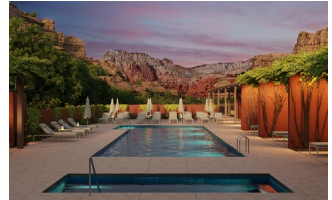
Member Relais & Châteaux since 2023 525 Boynton Canyon Road 86336, Sedona

Hotel and restaurant in the mountains. Mii amo is a renowned spa and wellness resort not far from the Grand Canyon. This sanctuary is located in the stunning red rocks of Boynton Canyon, one of the most powerful energy vortexes of Sedona, Arizona. Reconnect with nature and your nature in an enchanting setting where accommodations are designed to enhance guests' sense of place within the canyon. Dressed in all natural carpets, wood and artisan-designed throws, the rooms open to the vastness of the landscape dotted with prickly pears and pinyon pines. All have indoor fireplaces and private patios. Acclaimed for its unique holistic approach, Mii amo offers all-inclusive and customized journeys, including tailor-made treatments and guided meditations provided by intuitive and experienced professionals. This way, connected to each other, your mind and body will enjoy the flavors imagined by Hummingbird's chef, who favors an ingredient-based cuisine with regionally sourced produce.